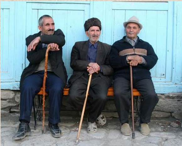
Locals taking it easy, Lahij, Azerbaijan

Cost £1995.00 per person in a twin room (excludes international flights) Single supplement charge £400.00