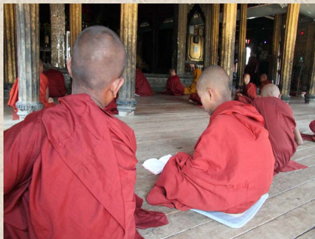
Novice Monks, Kalaywa Monastery

PLEASE NOTE: Pro-democracy leader, Aung San Suu Kyi, now considers that tourism should be encouraged to Burma, as long as it is run through private companies. As a result I have chosen to work with a local Burmese partner without connection to the government and who supports projects that help local communities in Burma and promote sustainable development