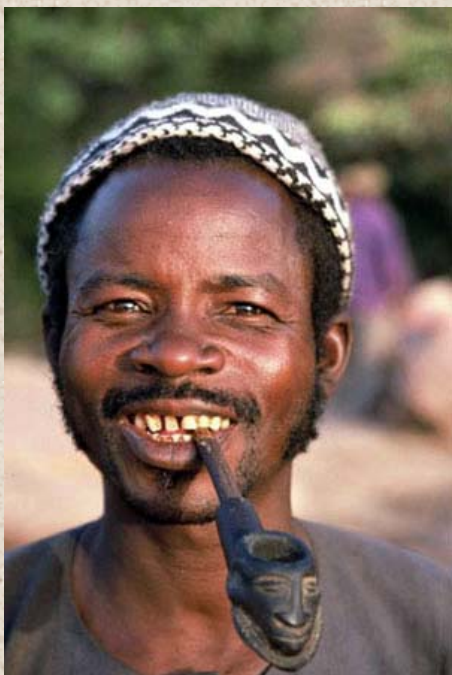
Dogon Man, Bandiagara Escarpment

Cost £2095.00 per person in twin room (excludes international flights) Single supplement charge £450.00