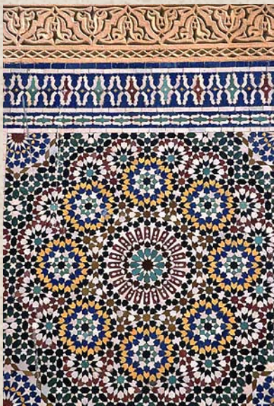
Ornate ceramic tilework, Fes

Cost £1795.00 per person in a twin room (excludes international flight) Single supplement charge £300.00