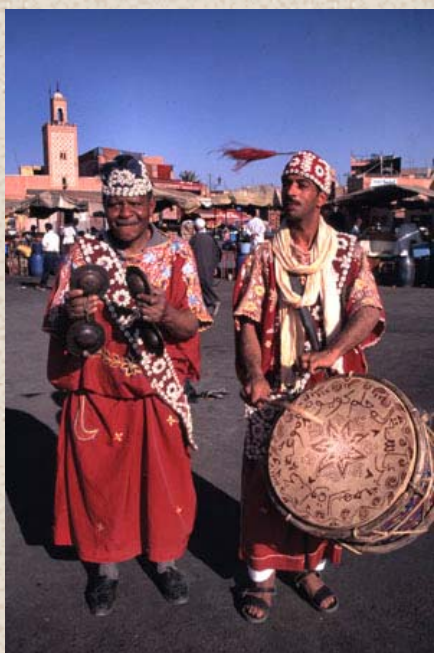
Gnaoui Musicians, Marrakech

Cost £1595.00 per person in a twin room (single supplement additional £200)