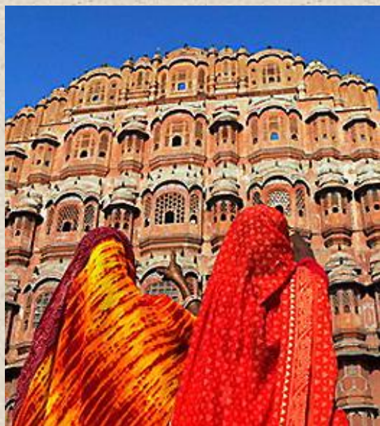
Hawa Mahal (Palace of the Winds), Jaipur

Cost £1995.00 per person in a twin room (excluding international flight to Delhi) Single supplement £425.00