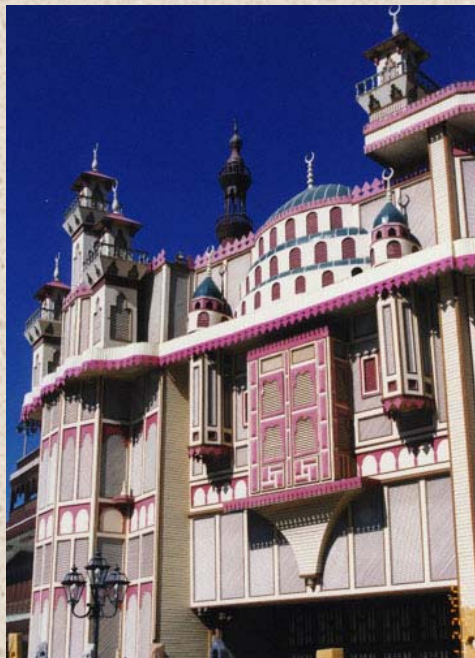
Abdul Raouf Khalil Museum, Jeddah