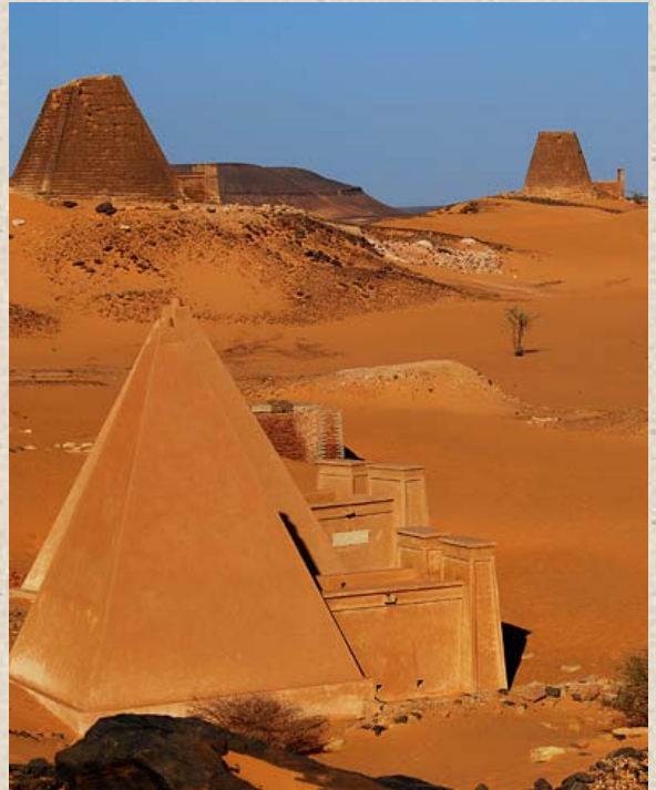
3000 BC Pyramid ruins, Meroe

Sudan is home to one of the world's oldest civilisations, with settlements dating back to 3000 BC. Located to the south of Egypt, the River Nile links the two countries both historically and geographically, however unlike its neighbour, Sudan remains virtually untouched by tourism. These magical lands of ancient Nubia offer a rich, cultural heritage, warm friendly people and a true sense of exploration. This unique archaeological tour covers the major sites that are concentrated to the north of Khartoum, including comfortable overnight lodges based at the location of the breathtaking ruins of Karima and Meroe. This makes this arid region of extraordinary archaeological interest and beautiful landscapes now accessible with a very reasonable degree of comfort.